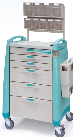
Avalo® Anesthesia Cart