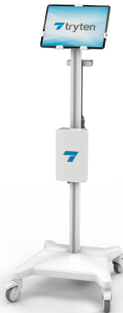
Tryten S1 Tablet Cart