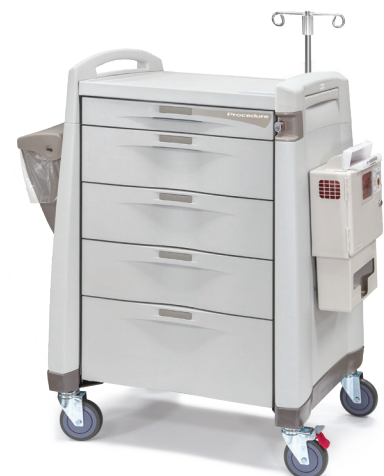
Avalo® Treatment Cart