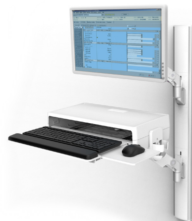
V6 Wall Workstation

Contact Capsa Healthcare for solutions to manage medications, supplies, and EHR/EMR.