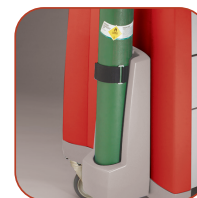
Oxygen Tank Holder