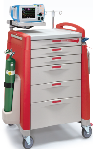
Avalo® Emergency Cart

High-level care depends on easy access to the right instruments and supplies when needed. Capsa Healthcare puts everything at your fingertips with a complete line of configurable medical carts. Organize and mobilize all supplies with ample capacity, security options, and durable construction.