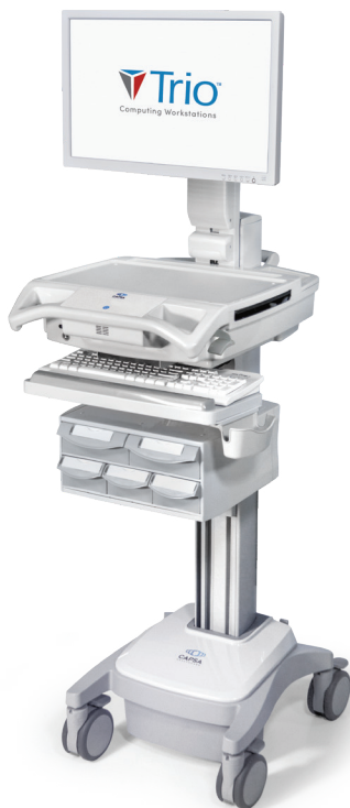
Trio™ NP Documentation Cart

Capsa's wall-mount computing solutions are slim profile and stow away neatly when not in use. Their flexible range of motion supports close patient care.